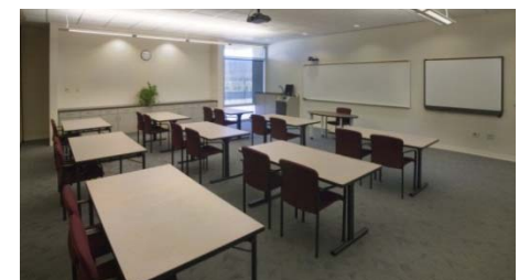
B114, 118, 120 can be setup for meetings or classes